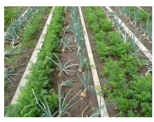
What are you thinking?

Do green manures or cover crops need to be in separate paddocks?