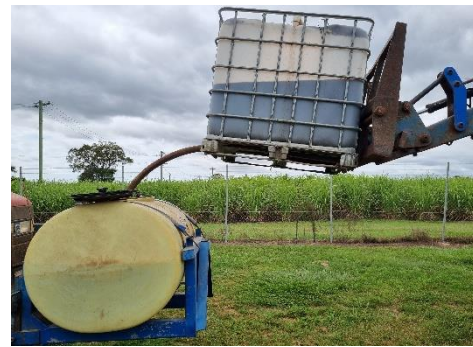
Gravity transfer of brew

Remainder of brew aerating for application tomorrow