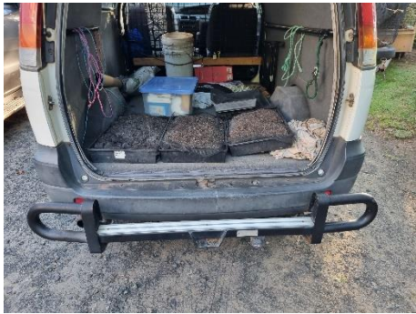
Delivery of Starter