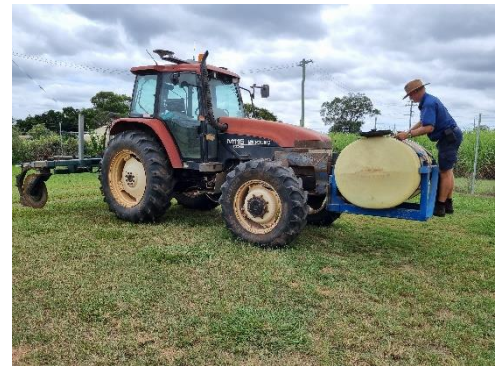
Preparation of Tractor tank