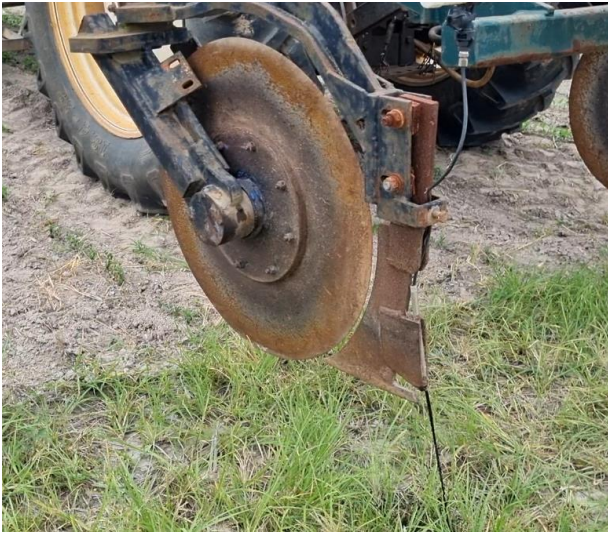
Testing of brew application