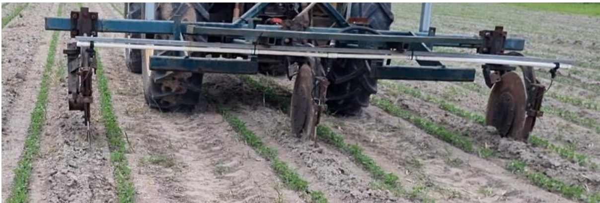
Record of trial rows without brew - remainder Treated