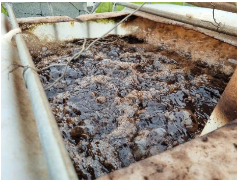
Surface of Brew