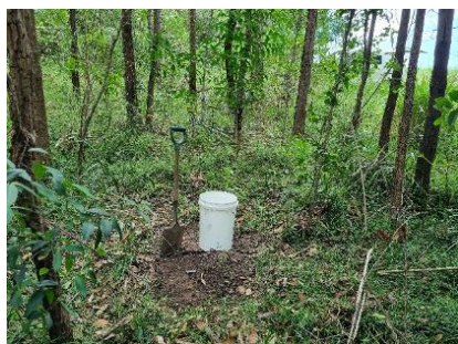
Photo 1 type of collecting area

Push aside the mulch (the layer of dead leaves and sticks) and collect the crumbly 1-2 cm layer which is the active layer. Collect about a litre just in case something goes wrong at first.