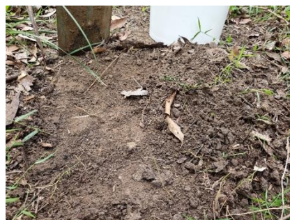
Photo 2 Soil after collecting, mulch removed

In front of shovel: - active crumb layer collected and firm soil now showing